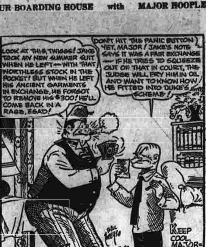
DON'T HIT THIS PANIC BUTTON